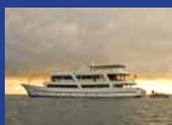
M/Y GALAPAGOS ODYSSEY